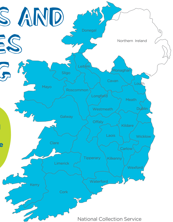
National Collection Service Blue areas indicate WEEE Ireland areas