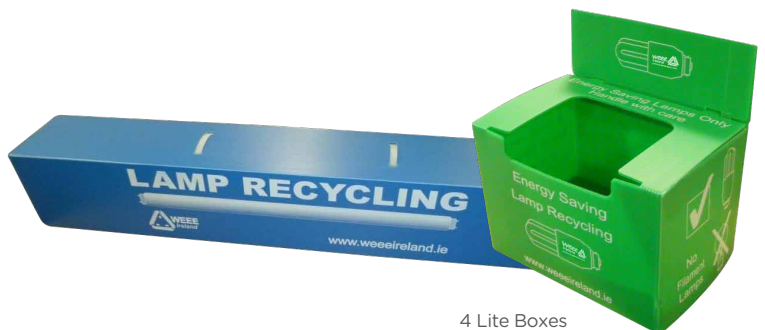
4 Lite Boxes